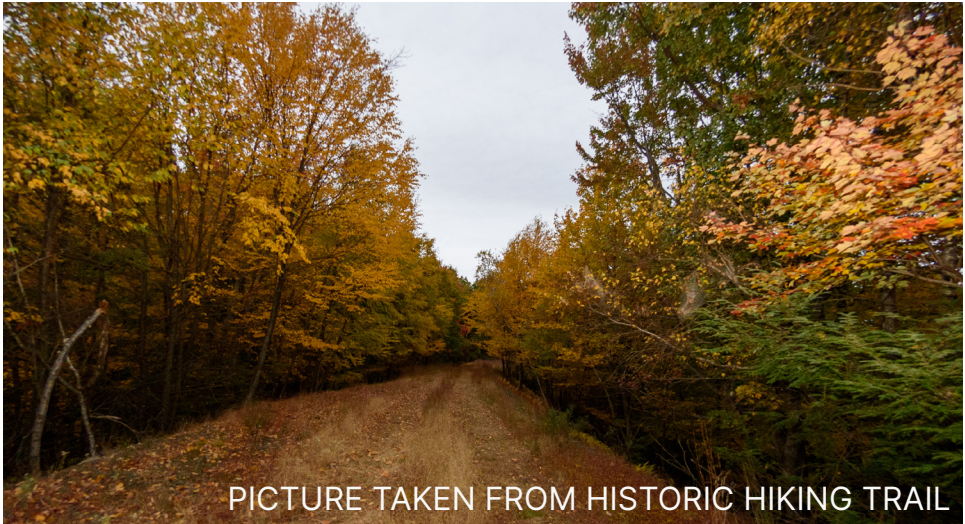
PICTURE TAKEN FROM HISTORIC HIKING TRAIL