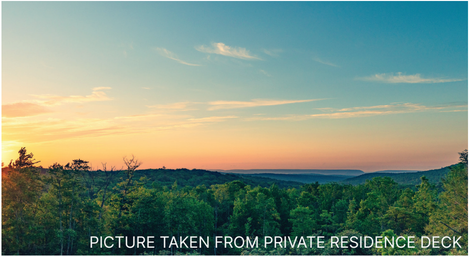
PICTURE TAKEN FROM PRIVATE RESIDENCE DECK