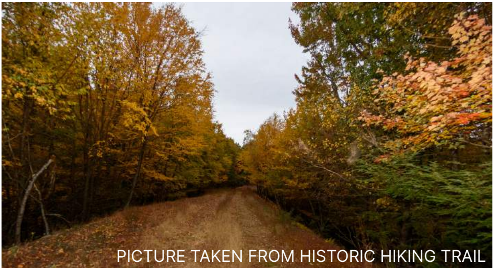
PICTURE TAKEN FROM HISTORIC HIKING TRAIL