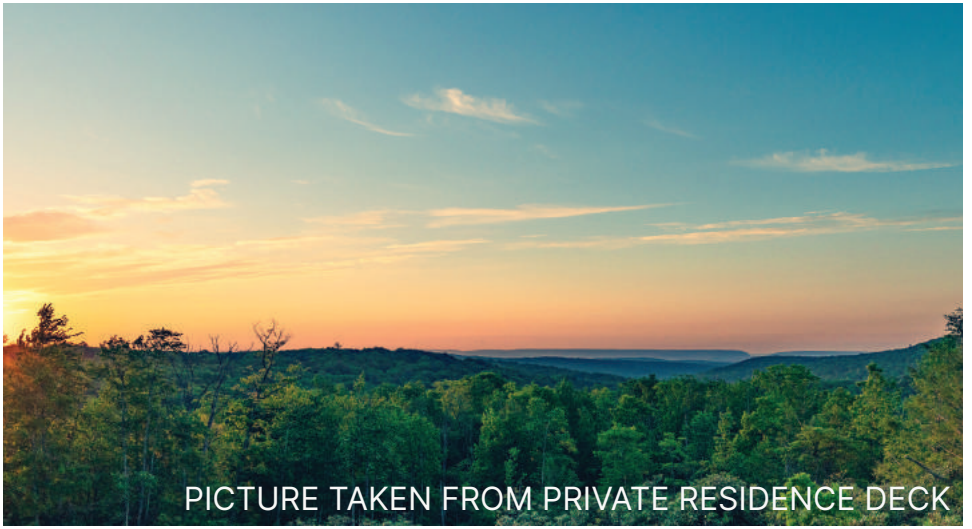
PICTURE TAKEN FROM PRIVATE RESIDENCE DECK